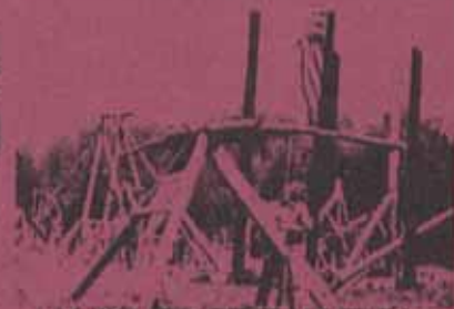
LATIN GETS IT ALL TOGETHER