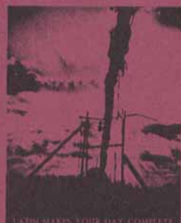
LATIN MAKES YOUR DAY COMPLETE