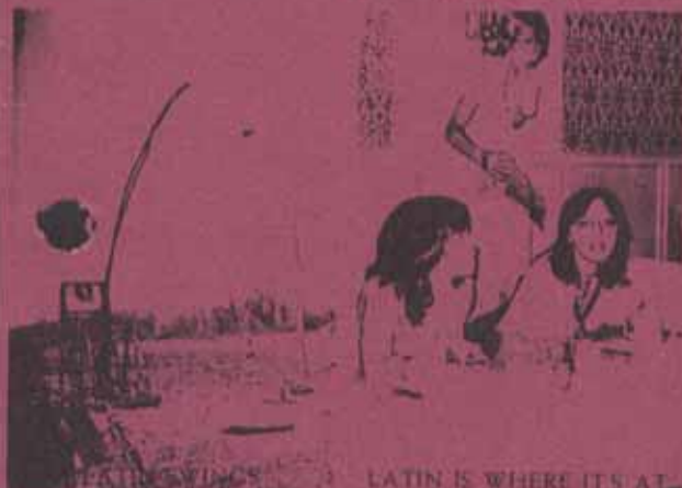
LATIN IS WHERE IT'S AT