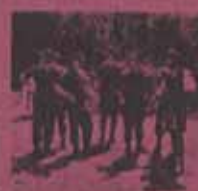
LATIN LETS THE ARMY JOIN YOU